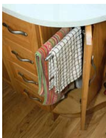
right Towels are kept out of sight in a narrow cupboard.