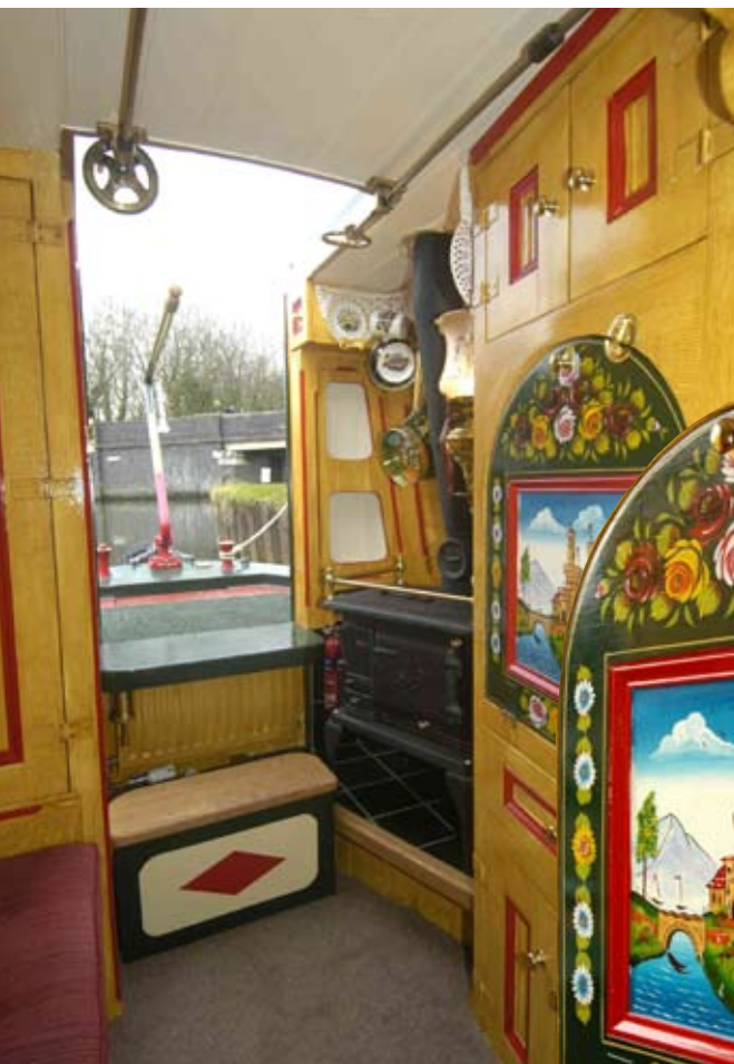
above The traditional rear half of the boatman's cabin.

It certainly looks the part – but is Aqua Vitae 's eye-catching appearance matched by a fit-out of equal quality? Graham Booth finds out